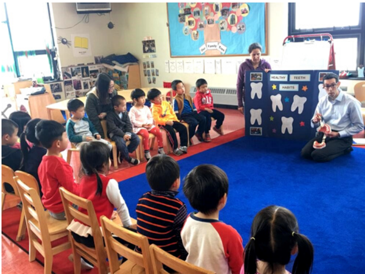
Bilingual Preschool at Yesler Community Center

The After School Program recognizes the importance of embracing and empowering parents as they support their children's education. We raise the voices of more than 60 families by facilitating meetings with Seattle Public Schools superintendent, principals, and teachers. We worked closely with a community-based partner, the Southeast Seattle Education Coalition, to provide an opportunity for parents to contribute their feedback in the Family Engagement Survey in their own language. Through our efforts, more than 200 surveys were collected in Chinese. The After School Program is committed to advocating for students and their families to advance educational justice and promote academic success by supporting family engagement.