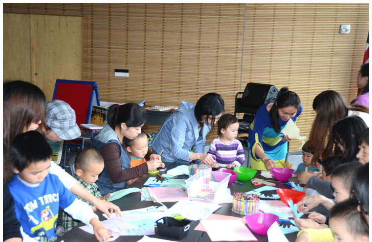
Kaleidoscope Play & Learn at Sammamish Library