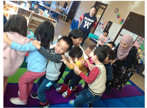
Bilingual Preschool in Newcastle