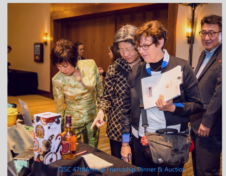
47th Annual Friendship Dinner and Auction