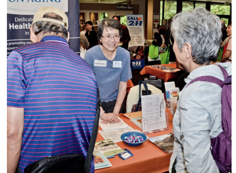
Annual Senior Resource Fair