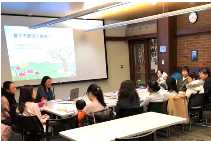
Child Care Health Consultation Outreach