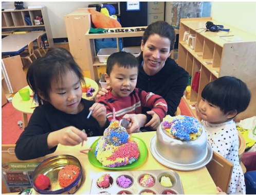
Bilingual Preschool in Seattle

From early years to grade school, CISC programs support a child's physical, social-emotional, and cognitive development and academic success. We utilize linguistically and culturally-relevant strategies to build on the strengths of each student and family.