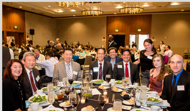
47th Annual Friendship Dinner and Auction