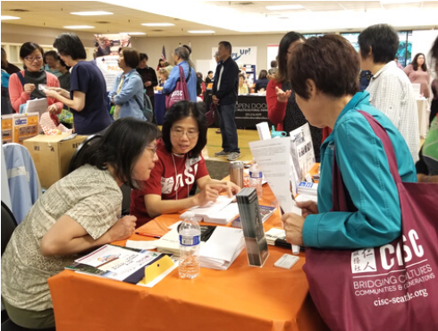
Healthcare Access Outreach

CISC utilizes a culturally responsive, strengths-based holistic approach to serve the community. Over the decades, we have developed programs to serve the entire family to help them thrive.