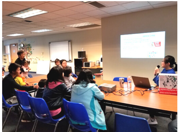
Kent Office Family Support Program

Our preschools create a learning environment that values and embraces the rich cultural and language backgrounds of families and children. Teachers strive to prepare children for their first day of kindergarten and support their physical, social, emotional, and cognitive development. One highlight of our Bilingual Preschool at Yesler Community Center in Seattle was a visit from a dentist and his staff who provided a hands-on presentation about the importance of good dental hygiene. The students saw the daily habit in a new light as parents informed us about their child's newfound enthusiasm for brushing their teeth. Students at our Bilingual Preschool at Aegis Gardens in Newcastle enjoyed a visit to the Sheraton Grand Seattle's Annual Gingerbread Village to see examples of design and construction. During our Winter Celebration, the children were inspired by what they saw as they created a gingerbread house together during an intergenerational activity with seniors.