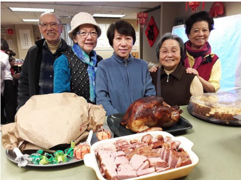
Sunshine Garden Senior Center

Taking care of and respect for our elders is a time-honored tradition. Our programs for older adults support their health and well-being. Our staff are committed to providing services and connecting seniors to resources that maintain and enhance their quality of life.