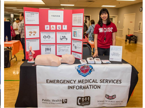
Emergency Medical Services