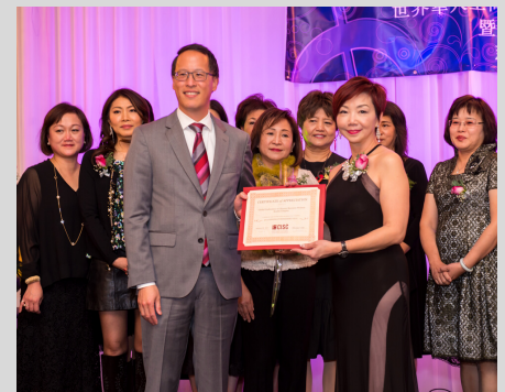
Global Federation of Chinese Business Women (GFCBW) and CISC Singing Fundraiser