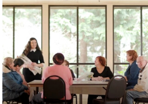
Russian Senior Activity Program